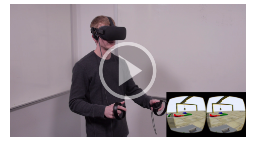
Watch the video at http://flexs.im/vr

FlexSim has expanded its virtual reality capabilities to include compatibility for the Oculus Touch hand controllers. The natural gestures and finger movement of the Oculus Touch will expand and add realism to your simulation experience.